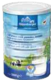
MILK POWDER 1.8 kg PACKING: 6 x 1.8kg