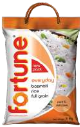
EVERYDAY BASMATI PACKING: 8x5KG 10x1KG