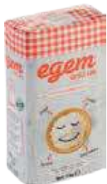
WHEAT FLOUR T450 - ALL PURPOSE T550 - BREAD PACKING: 25 KG BAG 1 KG PKTS