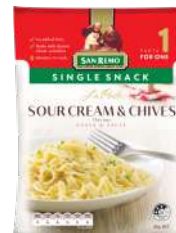
SOUR CREAM & CHIVES PACKING: 12 x 80g