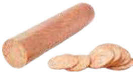
CHICKEN SALAMI PACKING: 5x2kg