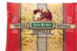
TRIVELLE #17 PACKING: 12 x 500g