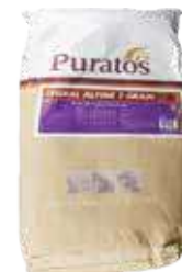
MULTI CEREAL BREAD MIX PACKING: