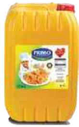
VEGETABLE OIL PACKING: 1x18Ltr