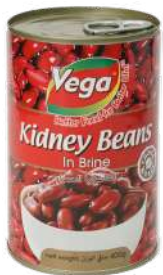
RED KIDNEY BEANS PACKING: 24x400g