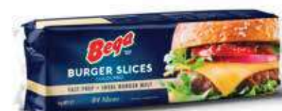
BURGER SLICES PACKING: 12 x 1kg