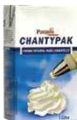
CHANTYPAK - NON DAIRY CREAM (WHIPPING CREAM) Packing: 12x1Ltr