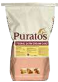
TEGRAL SATIN CREAM CAKE PACKING: 25kg