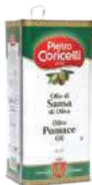
POMACE OLIVE OIL TIN PACKING: 4x5LTR