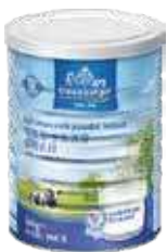
MILK POWDER 900g PACKING: 12 x 900g