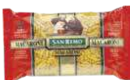
MACARONI #38 PACKING: 12 x 500g