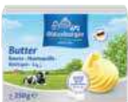
BUTTER 250g PACKING: 40 x 250g