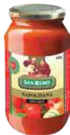
NAPOLITANA PACKING: 12 x 500g