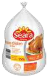
CHICKEN 800gm PACKING: 10x800g