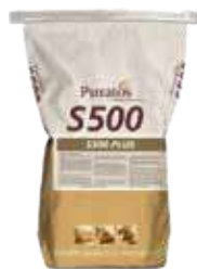
S500 A+ BREAD IMPROVER PACKING: 10kg