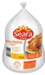
CHICKEN 1200gm PACKING: 10x1200g