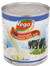
CONDENSED MILK PACKING: 24x390g