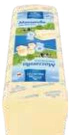
MOZZARELLA 3kg PACKING: 3kg block