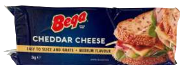
CHEDDAR BLOCK PACKING: 6 x 2kg