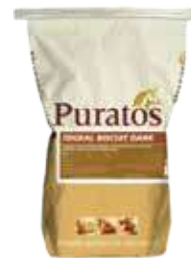
TEGRAL BISCUIT DARK PACKING: 25kg