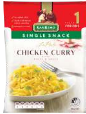
CHICKEN CURRY PACKING: 12 x 80g