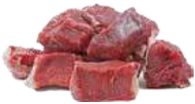
BEEF CHUNKS PACKING: 20x900g