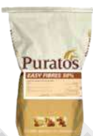
EASY FIBRES 50/50 PACKING: 20kg