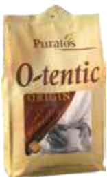
O-TENTIC DURUM PACKING: 10x1kg