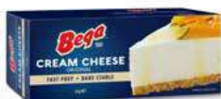
CREAM CHEESE PACKING: 6 X 2kg