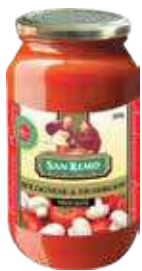
BOLOGNESE & MUSHROOM PACKING: 12 x 500g