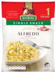
ALFREDO PACKING: 12 x 80g