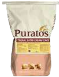
TEGRAL SATIN CREAM CAKE CHOCO PACKING: 12.5kg