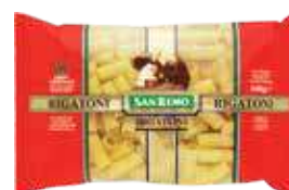
RIGATONI #22 PACKING: 12 x 500g