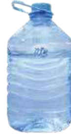
5 Ltr PACKING: 4x5Ltr