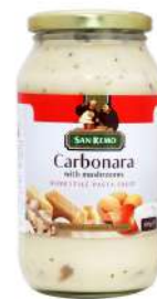
CARBONARA PACKING: 12 x 500g