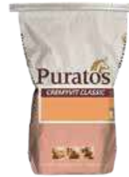
CREMYMIT CLASSIC PACKING: 15kg