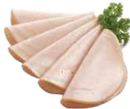
CHICKEN HAM PACKING: 4x2.5kg