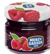
RASPBERRY PACKING: 48x28g