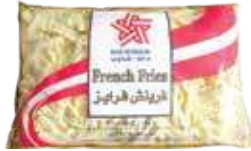
FRENCH FRIES CRINCLE CUT PACKING: 10x100g