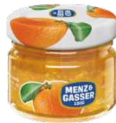
ORANGE PACKING: 48x28g