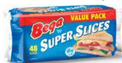
SUPER SLICES PACKING: 6 x 1kg