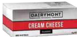
CREAM CHEESE PACKING: 6x2kg blocks