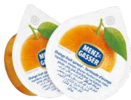
ORANGE PACKING: 200x14g