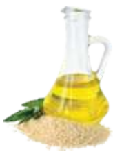
SESAME OIL PACKING: 12x360ml