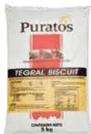
TEGRAL BISCUIT PACKING: 25kg