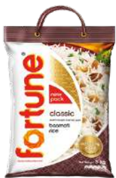
EVERYDAY BASMATI PACKING: 8x5KG 10x1KG