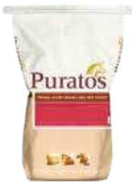
TEGRAL SATIN CREAM CAKE RED VELVET PACKING: 15kg