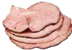
BEEF HAM PACKING: 4x2.5kg