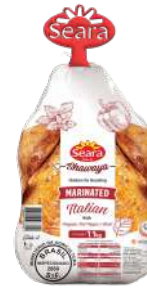
ITALIAN HERB MARINATED CHICKEN PACKING: 10x1100g