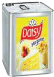
DAISY MARGARINE PACKING: 18KG