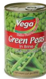
GREEN PEAS PACKING: 24x400g