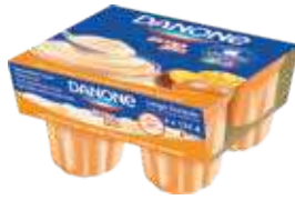
MANGO PACKING: 4x6x125gm