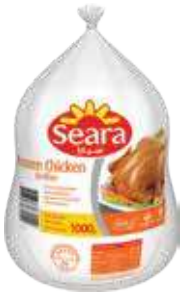
CHICKEN 1400gm PACKING: 10x1400g