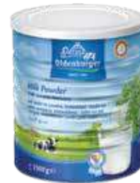
MILK POWDER 2.5 kg PACKING: 6 x 2.5kg