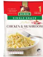
CHICKEN & MUSHROOM PACKING: 12 x 80g