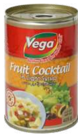
FRUIT COCKTAIL PACKING: 24x425g