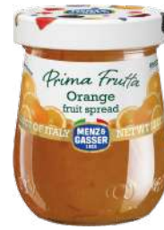
ORANGE PACKING: 12x340g