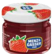
STRAWBERRY PACKING: 48x28g