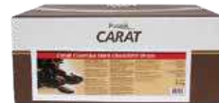
CARAT Coverlux Dark (Compound) Packing: 10kg