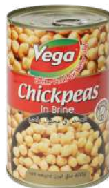
CHICKPEAS PACKING: 24x400g