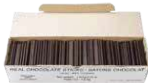
CHOCOLATE STICKS (BAKE STABLE) Packing: 15x1.6kg