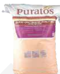
TEGRAL CONTINENTAL DONUT MIX (YEAST RAISED) PACKING: 25kg