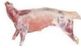
LAMB CARCASS WHOLE PACKING: 15kg approx.