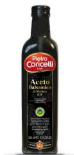
BALSAMIC VINEGAR PACKING: 12x500ml