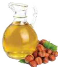
HAZELNUT OIL PACKING: 500ml