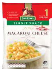
MACARONI CHEESE PACKING: 12 x 80g