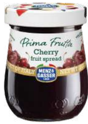
CHERRY PACKING: 12x340g