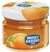
APRICOT PACKING: 48x28g