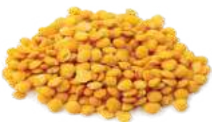
MOONG DAL (YELLOW) PACKING: 15 KG BAG