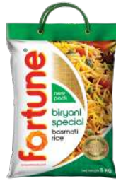
BIRYANI SPECIAL BASMATI PACKING: 4x5kg