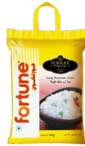
JUBILEE PACKING: 8x5KG