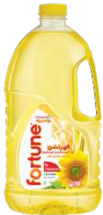
SUNLITE SUNFLOWER OIL PACKING: 8x5KG

Dear Soup, We all know who the true food comforter is. Sincerely, Dal Khichdi