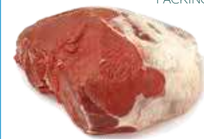
BEEF TOPSIDE PACKING: 20kg