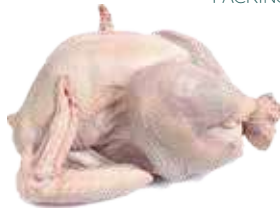
WHOLE TURKEY PACKING: 7-8kg/ pc