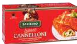
CANNELLONI PACKING: 12 x 250g