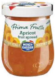
APRICOT PACKING: 12x340g