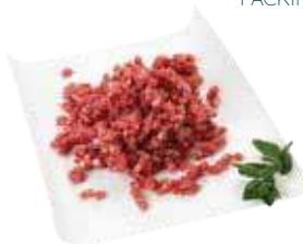
BEEF MINCED PACKING: 40X450g