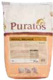
TEGRAL BROWNIE MIX PACKING: 15kg