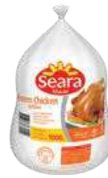
CHICKEN 1000gm PACKING: 10x1000g