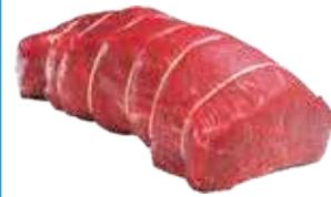
BEEF TENDERLOIN PACKING: 18kg