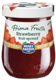
STRAWBERRY PACKING: 12x340g