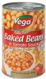
BAKED BEANS PACKING: 24x400g