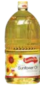
SUNFLOWER OIL PACKING: 6x2Ltr