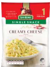
CREAMY CHEESE PACKING: 12 x 80g